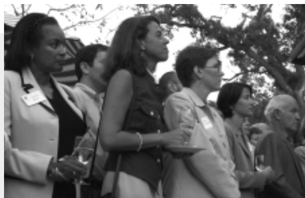
Guests listen to the program.